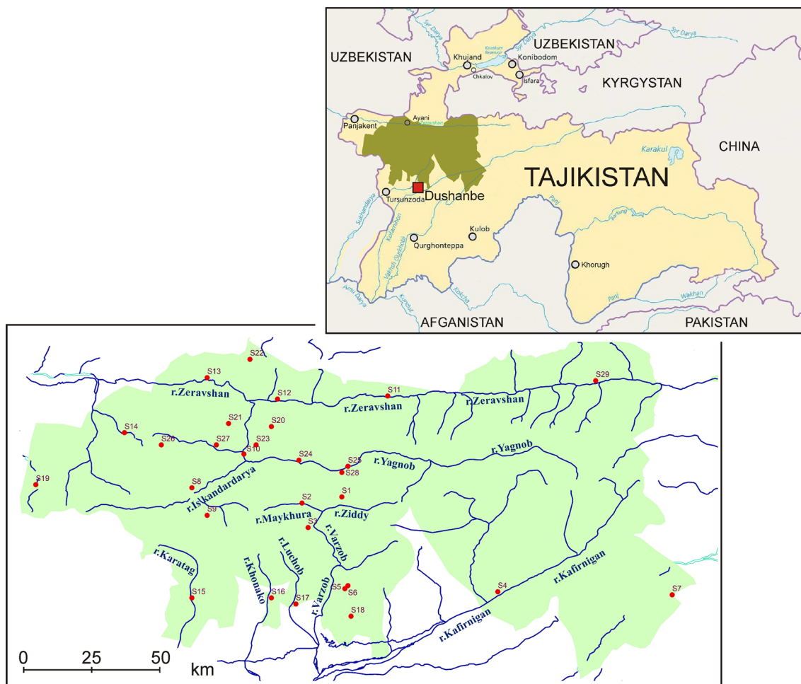
Fig. 1 Location of collecting points on investigated area with respect to Tajikistan general map (inset)

elements: Na, Mg, Al, Cl, K, Sc, Ca, Ti, Cr, V, Mn, Ni, Fe, Co, Zn, Se, As, Br, Sr, Rb, Zr, Mo, Sb, I, Ba, Cs, La, Ce, Nd, Eu, Gd, Sm, Tb, Yb, Tm, Hf, Ta, W, Th, and U. More details concerning the sample preparation and INAA measurements can be found in (Culicov et al. 2016; Pavlov et al. 2016).